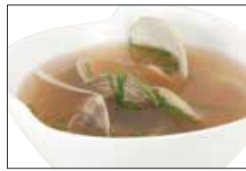
Clam Soup $5.75