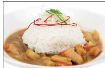
Curry Don $9.75