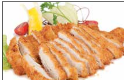
Chicken Katsu $14.25