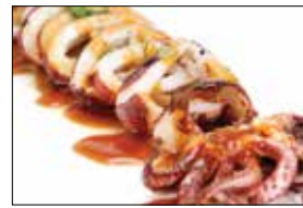
B.B.Q. Squid $8.25