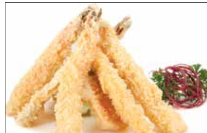
Shrimp Tempura $14.5