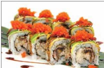
Crispy Dragon Roll $6.5