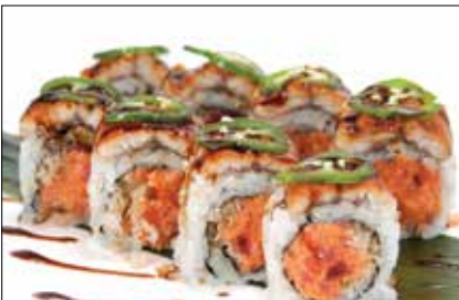
Rock & Roll $9.75