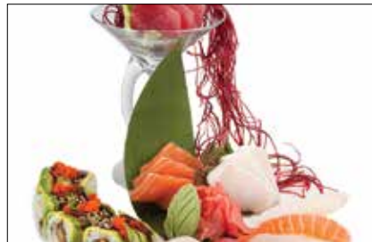
Sushi & Sashimi $22.5