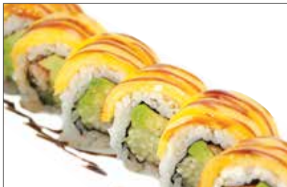
Mango Tango Roll $9.50