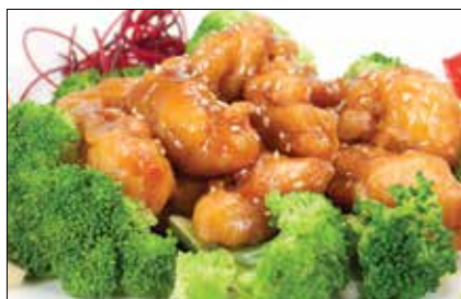
Sesame Chicken $10.5