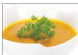
Pumpkin Soup $4.75