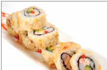
Dynamite Roll $8.75