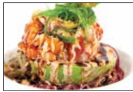
Treasure Island $8.25