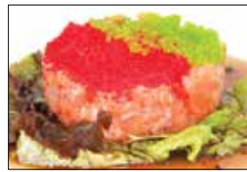
Salmon Tartar $9.25