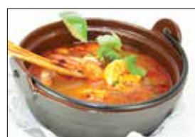
Tom Yam Soup $6.5