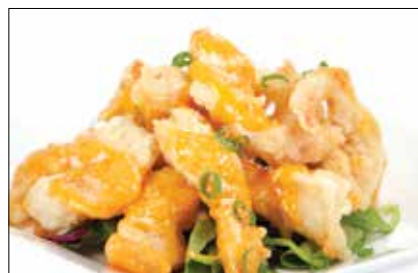
Rock Shrimp Tempura $8.25