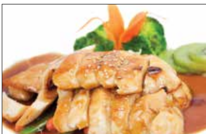
Chicken Teriyaki $12.75