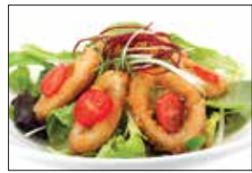
Calamari Salad $7.25