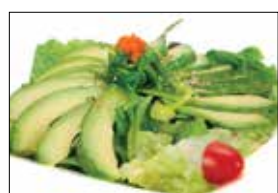
Avocado Salad $5.75