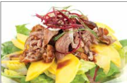
Crispy Duck Salad $8.25