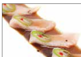
Yellowtail Sashimi $9.25