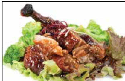
Garlic Duck $18.50