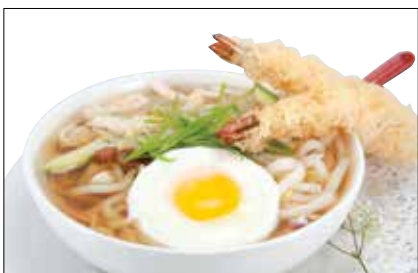
Nabe Yaki Udon $11.75