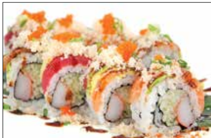
Tiger Roll $9.75