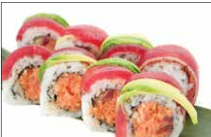
Crazy Tuna Roll $12.25