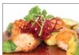
Avocado Salmon $8.25